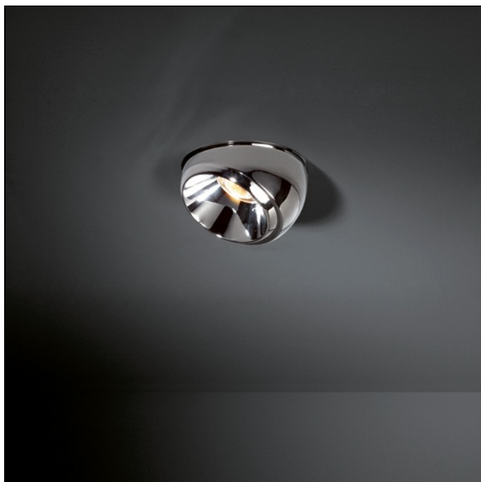
BOLSTER RECESSED 155 GU10